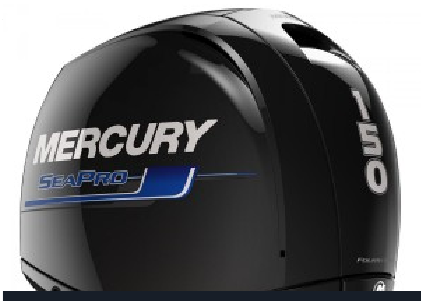
Mercury 150 HP Sea Pro Fourstroke