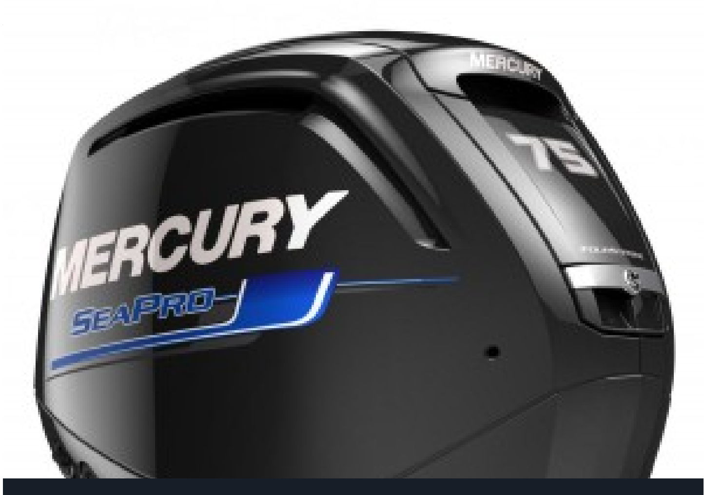
Mercury 75 HP Sea Pro Fourstroke POA